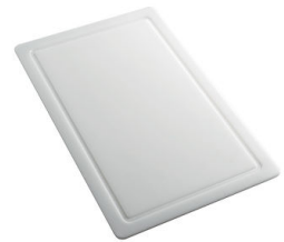
HDPE Chopping board 8657 001