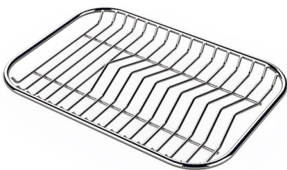
Stainless steel plate rack only usable in combination with the accessories 8644 003 8100 154